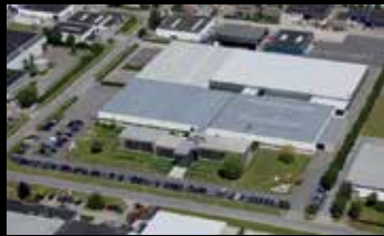
Holmatro Netherlands Rescue equipment Raamsdonksveer, The Netherlands T +31 (0)162 58 92 00 E rescue@holmatro.com Manufacturing, sales & service