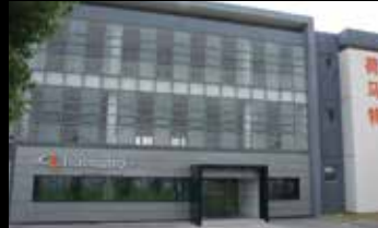
Holmatro China Suzhou, Jiangsu Province, China Sales & service