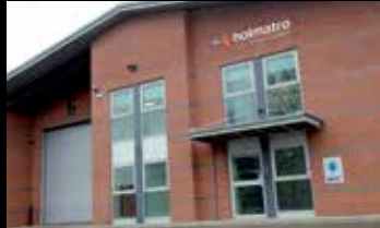
Holmatro UK Nottingham, UK Sales & service