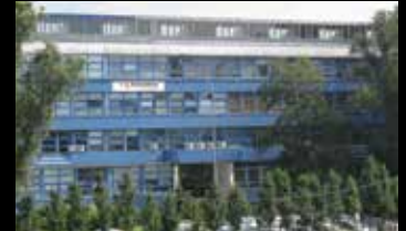
Holmatro Poland Warsaw, Poland Sales & service