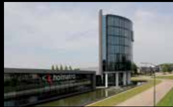
Holmatro Group World Headquarters Raamsdonksveer, The Netherlands