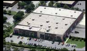
Holmatro USA Glen Burnie, MD, U.S.A. Manufacturing, sales & service